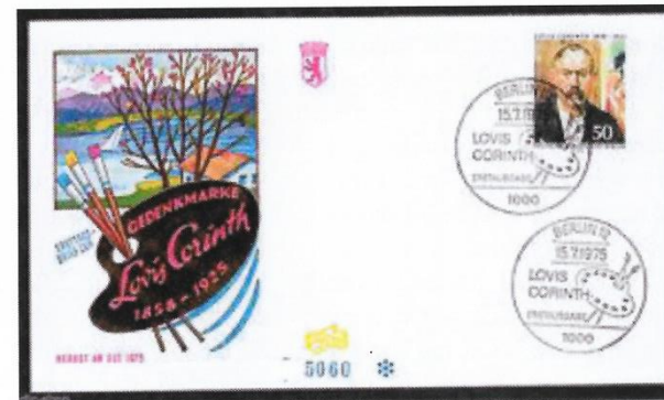
Lovis Corinth. Associated stamps.